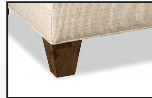
2 Tapered Leg