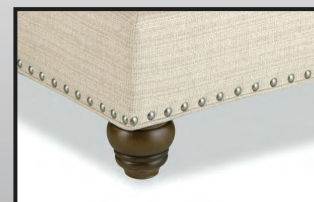
5 Turned Leg W/ Nails