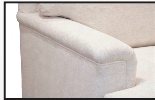
7 Padded Track Arm