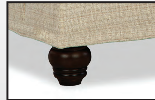
3 Turned Leg