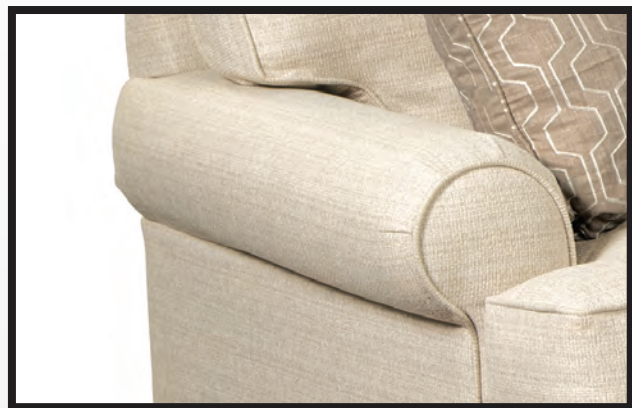
2 Sock Arm