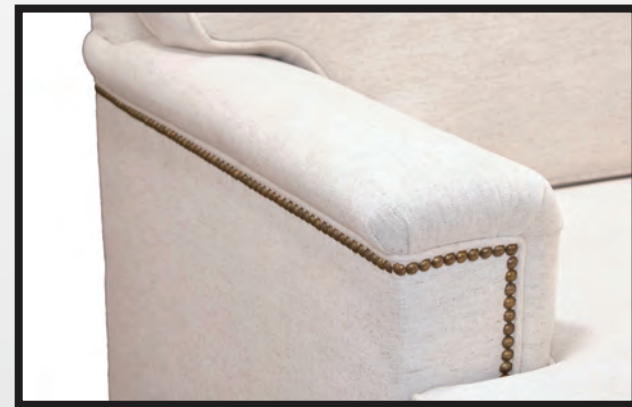
8 Padded Track Arm W/ Nails