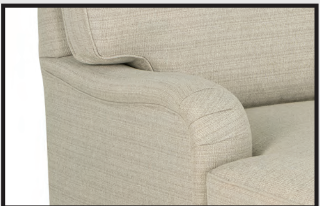
5 English Arm