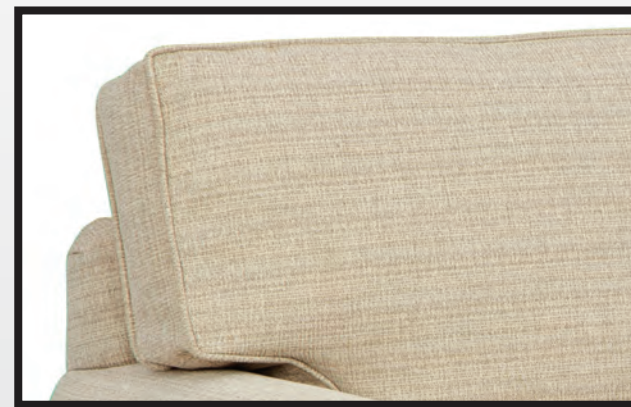
3 Semi-Attached Boxed Back