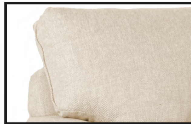
1 Semi-Attached Knife Edge Back