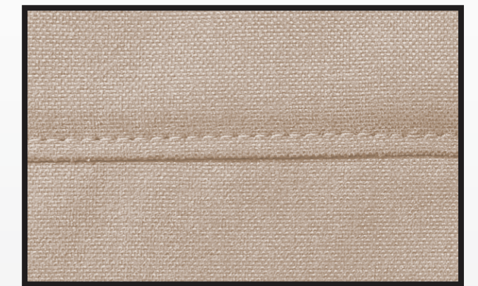
2 French Seam/ Single Needle