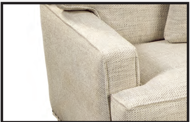
4 Track Arm