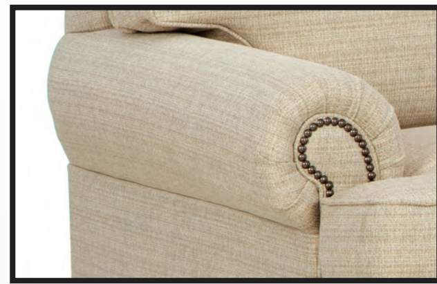
6 Panel Arm W/ Nails