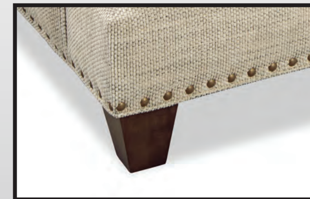
4 Tapered Leg W/ Nails