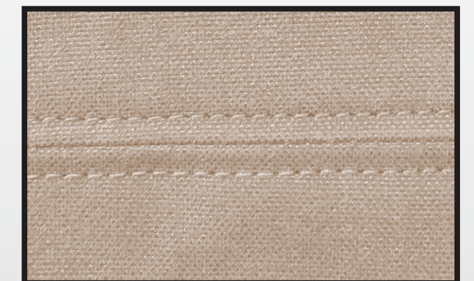
3 Saddle Stitch/ Double Needle