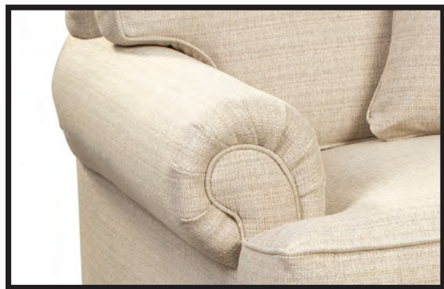
1 Panel Arm