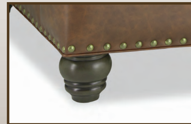
5 Turned Leg w/ Nails