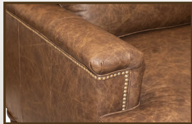
8 Padded Track Arm W/ Nails