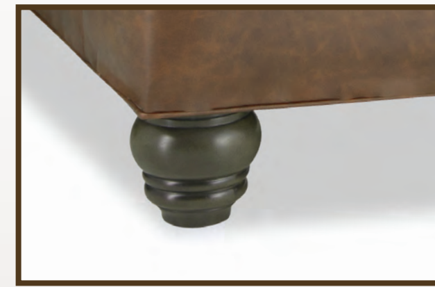
3 Turned Leg