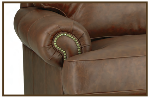
6 Panel Arm w/ Nails