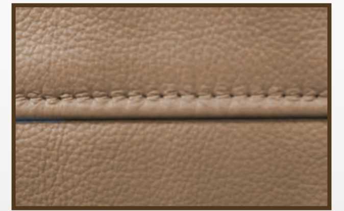
2 French Seam/Single Needle