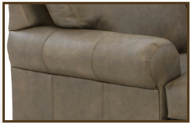
2 Sock Arm