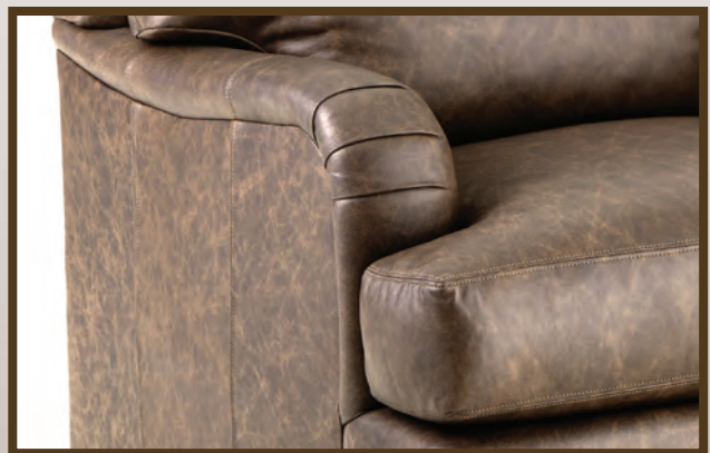
5 English Arm