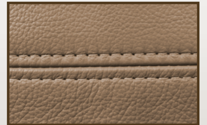
3 Saddle Stitch/Double Needle