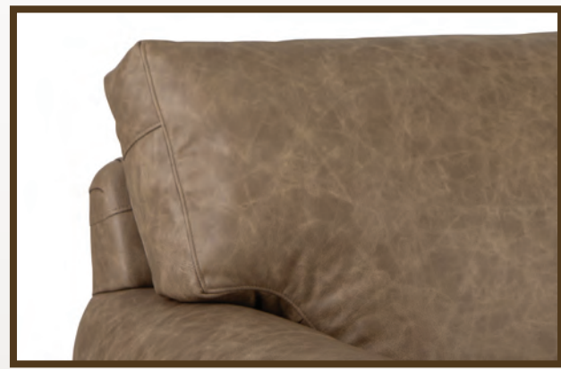
3 Semi-Attached Boxed Back