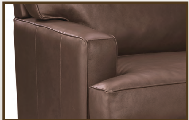
4 Track Arm