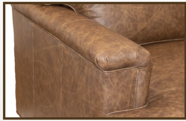
7 Padded Track Arm