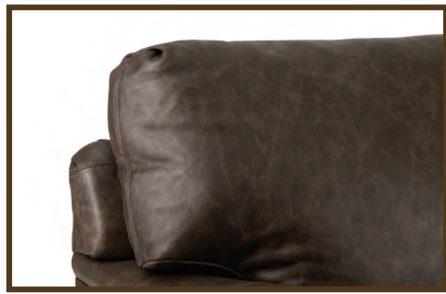
1 Semi-Attached Knife Edge Back