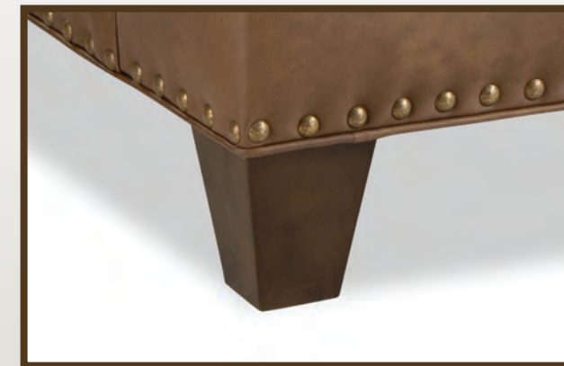
4 Tapered Leg w/ Nails