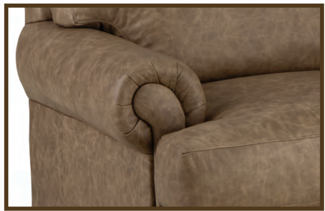
1 Panel Arm